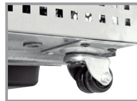
1 1/2" diameter dual swivel castors for "LP" models.