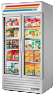
Standard White Exterior