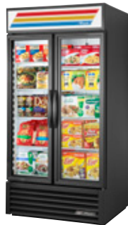
Optional Black Exterior