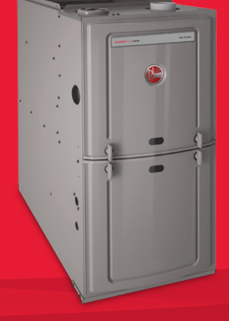
Classic Plus<sup>™</sup> Series R801T / R802P