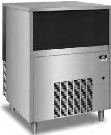
Model UNF-0300A Nugget Ice Machine