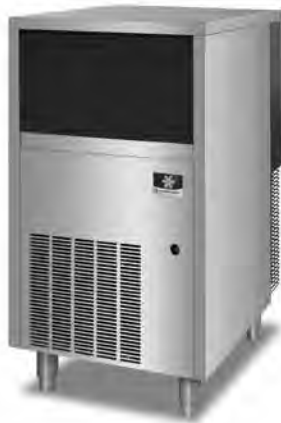
Model UNF-0200A Nugget Ice Machine