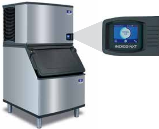
Indigo NXT Series iT0450 Ice Machine on D400 Bin

Designed for operators who know that ice is critical to their business, the Indigo NXT Series ice machine's preventative diagnostics continually monitor itself for reliable ice production. Improvements in cleanability and programmability make your ice machine easy to own and less expensive to operate.