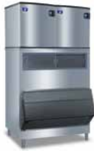
Two IDF-1800C Ice Machines on a F-1650 Bin

QuietQube Series Remote System consists of a remote condensing unit, interconnecting refrigerant lines, ice machine head section along with an ice storage bin, countertop dispenser, or floor dispenser. All ordered separately. QuietQube ice machine with CVD condensing unit is designed as a Manitowoc system and cannot be used with any other ice machine or remote condenser brand.