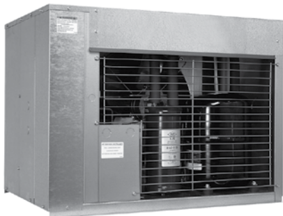
CVDF1800 Condensing Unit 208 V