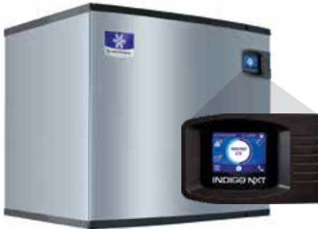
IDF-1800C Ice Cube Machine - 115V