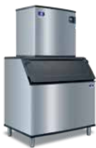
IDF-1800C Ice Machine on a D-970 Bin