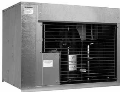
ICVD Condensing Unit