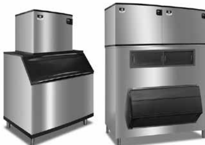
ID-1472C Ice Machine on a B-970 Bin