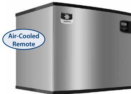
ID-1472C Ice Cube Machine - 115V