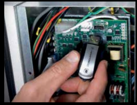
USB Port Firmware Updates