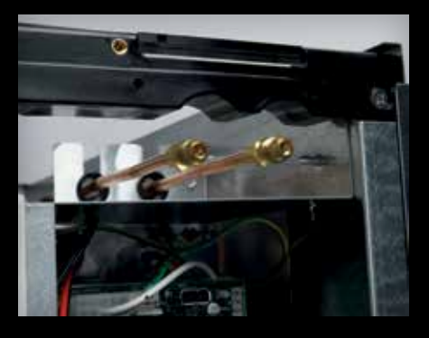
Easy Frontal Service Access Ports