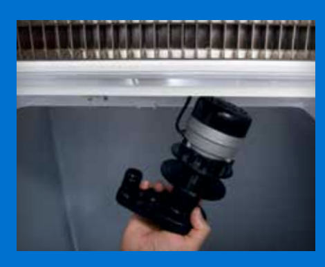
Snap-fit water pump