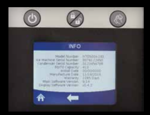
One touch machine info