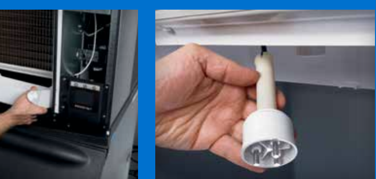
Rounded foodzone corners