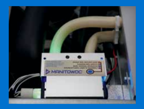
LuminIce II Growth Inhibitor accessory

Indigo NXT coupled with the D-bin ice storage bin, provides added sanitation while transporting ice from the bin to its designated location. The new ergonomic NSF scoop, keeps the thumb and knuckles from touching the ice and is included with every D-bin ice storage bin. The internal scoop holder keeps the handle above the ice, free from contamination. For those occasions when the scoop must be keep outside the bin, there is an optional NSF approved, external scoop holder which keeps the ice scoop covered and conveniently located.