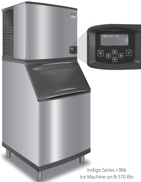
Indigo Series i-906 Ice Machine on B-570 Bin

Designed for operators who know that ice is critical to their business, the Indigo™ Series ice machine's preventative diagnostics continually monitor itself for reliable ice production. Improvements in cleanability and programmability make your ice machine easy to own and less expensive to operate. New Levels of Performance—showcasing improved ice harvest along with reductions in energy consumption.