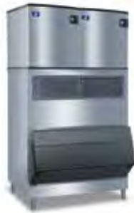
Two IDF1400C Ice Machines on a F-1650 Bin