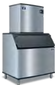
IDF1400C Ice Machine on a D-970 Bin