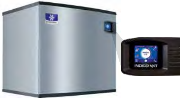
IDF1400C Ice Cube Machine - 115V