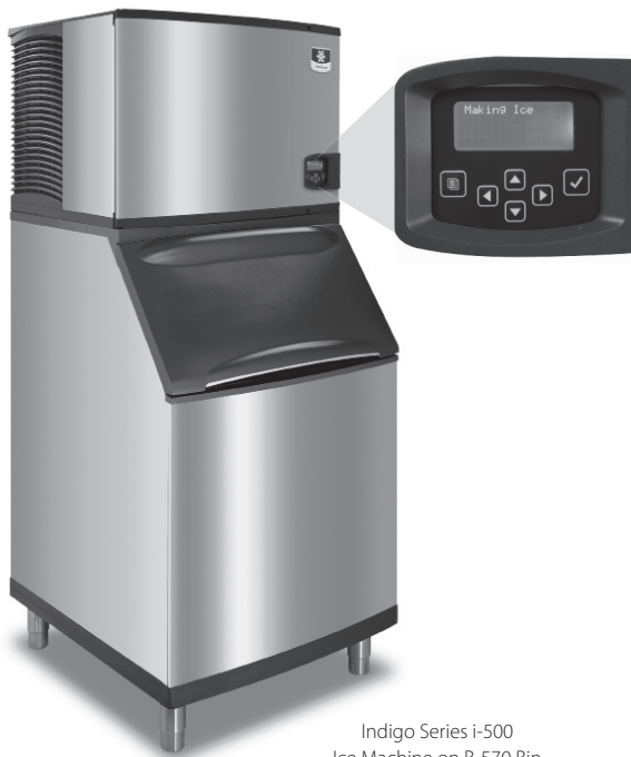
Indigo Series i-500 Ice Machine on B-570 Bin

Designed for operators who know that ice is critical to their business, the Indigo™ Series ice machine's preventative diagnostics continually monitor itself for reliable ice production. Improvements in cleanability and programmability make your ice machine easy to own and less expensive to operate.