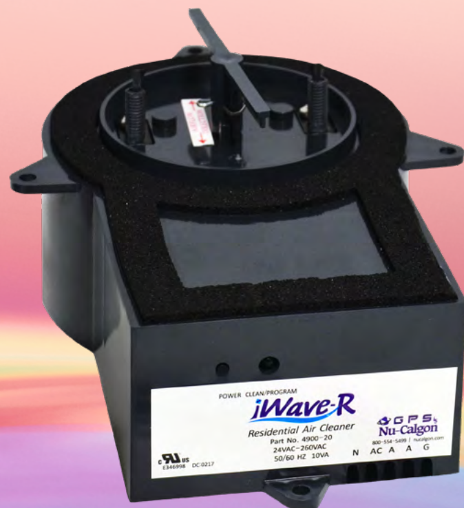
iWave-R P/N 4900-20