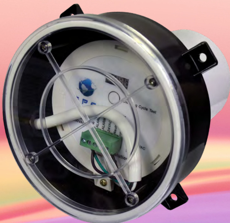
iWave-C P/N 4900-10