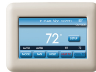
TSTAT0201CW Recommended (sold separately)

* Applies to original purchaser/homeowner, some limitations may apply. See Warranty certificate for complete details.