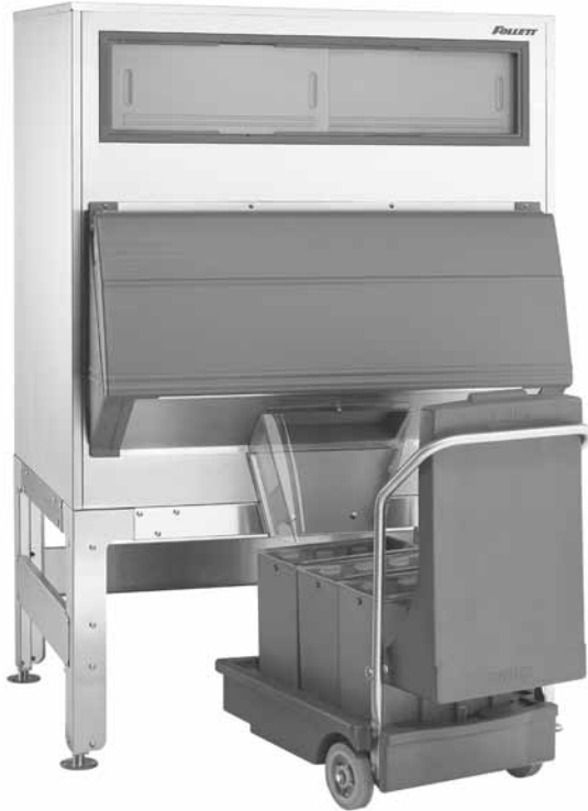
Model DEV1010SG-48 with SmartCART 75 ice cart

Easy to clean corrosion-resistant ABS/poly tops! Lifetime cabinet and liner warranty!