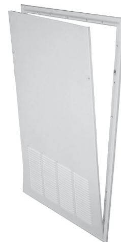
Optional wall panel (Recessed wall application)