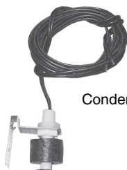
Condensate Overflow Switch #SS3