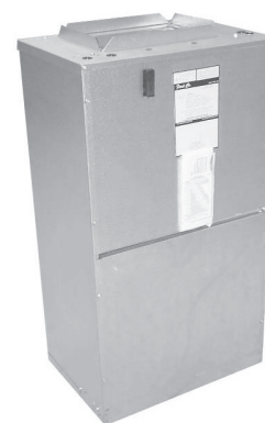
Unit shown with optional bottom return air kit (#90PK4 or #90PK5)