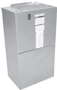
Unit shown with bottom return air cover (Closet application - Bottom Return Air)

The UC series fan coil is designed as an upflow indoor air handler for use with split-system heat pumps or condensing units.