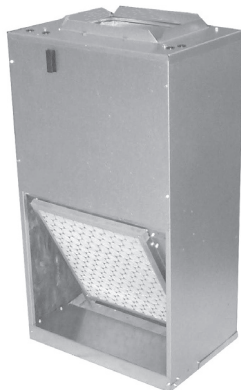
Unit shown without wall panel (Closet application - Front Return Air)