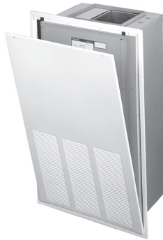
Unit shown with louvered wall panel (Recessed wall application)