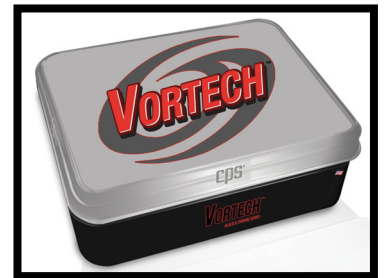
Custom packaging for a custom tool