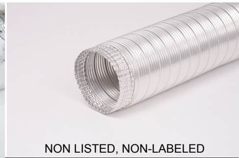
NON LISTED, NON-LABELED