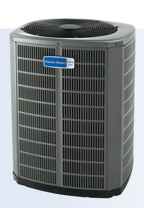
AccuComfort™ Platinum 20

Our most efficient and powerful heat pumps. Enjoy the highest level of comfort and maximum efficiency with features like Duration™ variable speed compressors and Spine Fin™ coils.