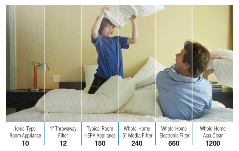
Ratings of cubic feet per minute of clean air delivered for a typical 3-ton heating and cooling system: the higher the value, the more effective the air cleaner.

Want 99.98% clean air? Then choose the home air filtration system that gives 110% – American Standard's revolutionary AccuClean.™ By removing up to 99.98% of unwanted allergens down to .1 micron from the filtered air, AccuClean is 100 times more effective than a standard 1" throwaway filter. Simply put, AccuClean works harder, so you and your family can breath easier.