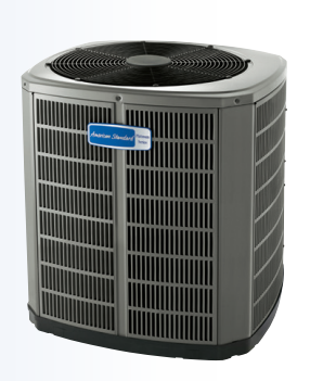
AccuComfort™ Platinum 18