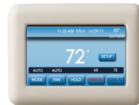
TSTAT0201CW Recommended (sold separately)

* Applies to original purchaser/homeowner, some limitations may apply. See Warranty certificate for complete details.